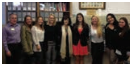
Child Life track students visit the Child Life Historical Archives.

In 2018, the Department of Human Development and Family Science at Syracuse University acquired the first endorsement by the Association of Child Life Professionals. This historic honor recognizes the quality of teaching and learning in our specialized courses that prepare students to enter a global healthcare field.