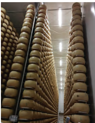
Parmesan cheese wheels in Modena.