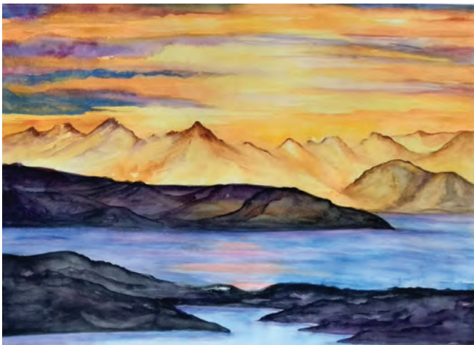
Golden Skye and the Red Cuillin Hills