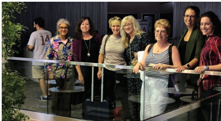
While waiting for their flight back to Syracuse, the NSD faculty visited the urban garden at Chicago's O'Hare Airport.