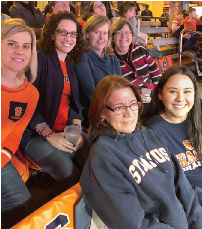
Some of the NSD faculty and staff showed their support for the SU Women's Basketball team in February at the Carrier Dome.