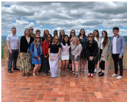
Frantoio Franci in Maremma.