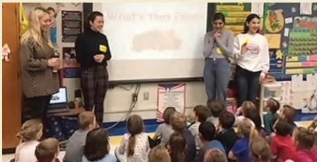
Skaneateles School District

Our students led a class of 50 kindergarten students in games that helped them properly identify food groups.