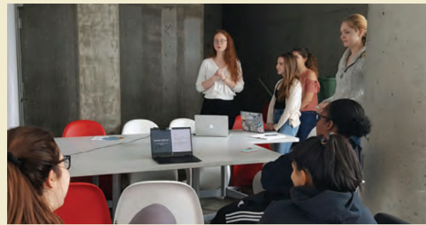
SU Food Services

Our students led an on-campus health event showcasing healthy carbs and dispelling myths about low-carb dieting.