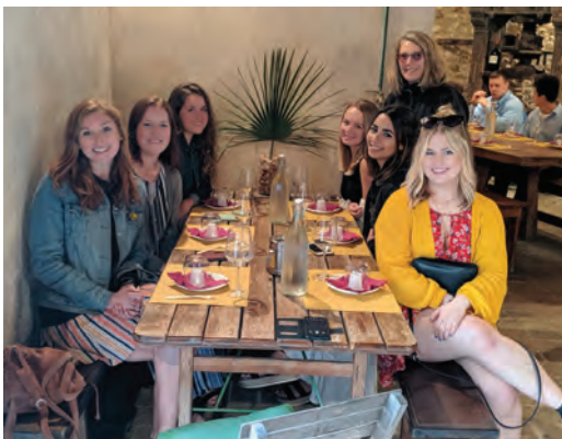
Tasting pecorini cheese and chianti at Corzano and Paterno.

Next year, the class leading up to the trip will be completely online and we will offer two trips: one late May and one mid-June so students, alumni and faculty can enroll. Deadlines are early October, so watch your emails to enroll. For more information, contact thoracek@syr.edu .