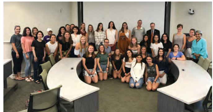
Chancellor Syverud visited the NSD 555 class, Food, Culture and Environment, Fall 2018.