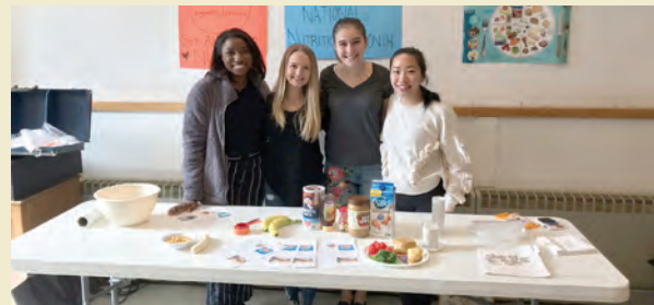
OCO Nutrition Services

Our students conducted a food demo on healthy breakfast and/or snack items (including no-bake energy bites and smoothies) to a group of 35 seniors living in the community.