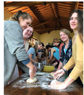
Making pizza at La Ginestra.