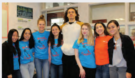
Books and Cooks Spring 2019