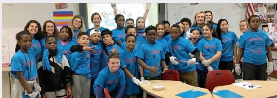
Books and Cooks

semester, the students studied Kenya and made Kachumbari. In Italy, they studied carbohydrates and made Caprese salad. While studying Egypt and proteins, they made and enjoyed hummus. Via a study of Cuba and fats, they made a traditional pineapple, avocado and rice salad. Finally, via a virtual trip to India, they studied vitamins and minerals and made