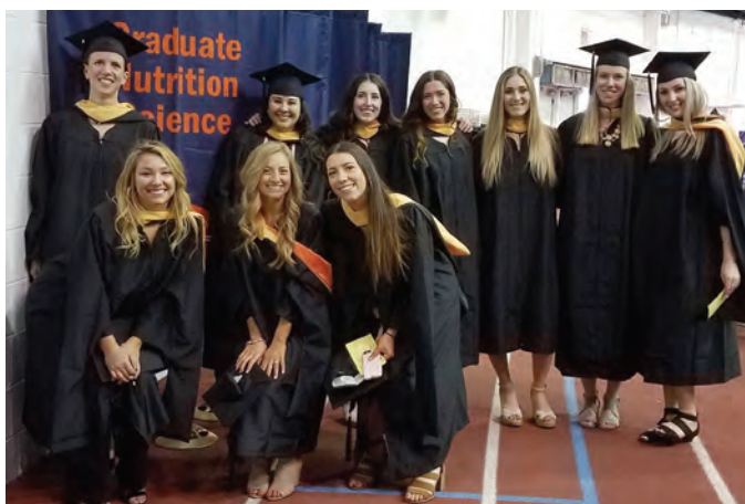
Graduate class of 2019